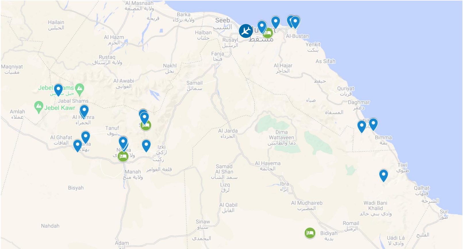
Map Link : Oman Explorer